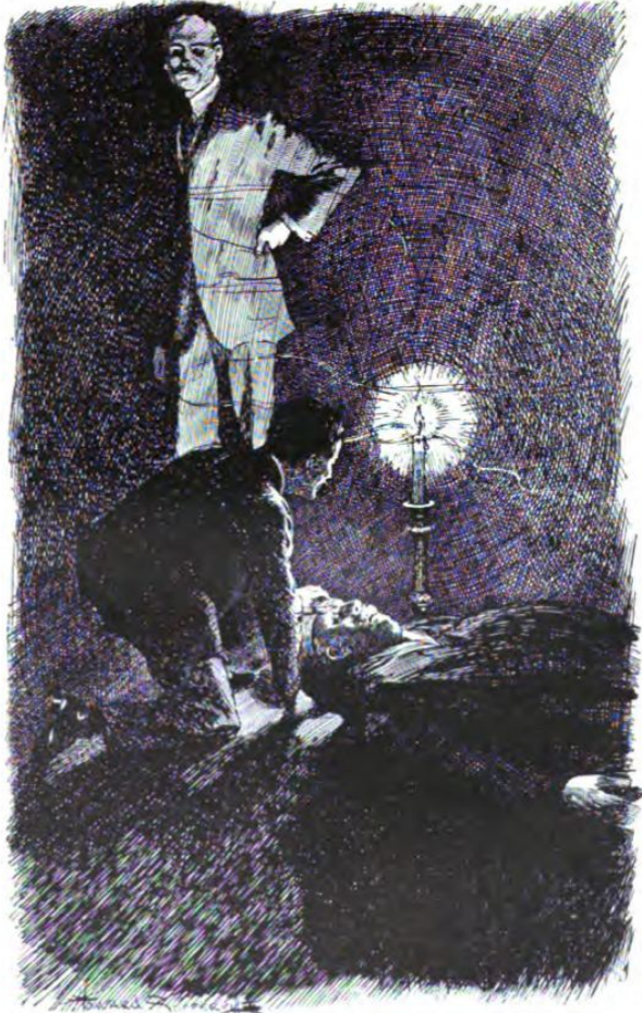
"UZALI BENT COOLLY AND CRITICALLY OVER IT."