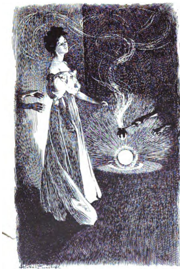
"A PAIR OF ARMS CAUGHT HER AND SHE WAS LIFTED FROM THE FLOOR."